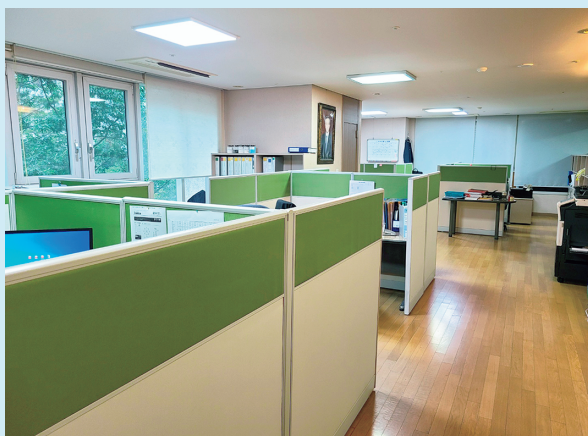
ホソカワミクロン韓国事務所 Office of Hosokawa Micron (Korea) Ltd.