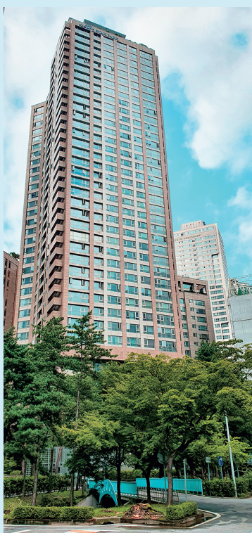
ホソカワミクロン韓国事務所の入る ジャムシル・シャープスターパーク ビル Office of Hosokawa Micron (Korea) Ltd. (in Jamsil the sharp star park Building)

Hosokawa Micron Korea (HMK) located in Seoul was established in 1996 as a representative of Hosokawa Micron Group and currently has 10 employees. Most of them are technical staff mainly working for equipment sales throughout South Korea handling the products for the entire Hosokawa Group for powder processing of advanced materials like the booming secondary batteries. HMK is currently introducing the teleworking making use of the Internet to improve work efficiency to cope with the COVID-19 problems. By adapting quickly to the rapidly changing global circumstances, HMK intends to make continuous efforts in order to establish a firm position in the Korean powder equipment industry and contribute to the development of the Korean powder industry.