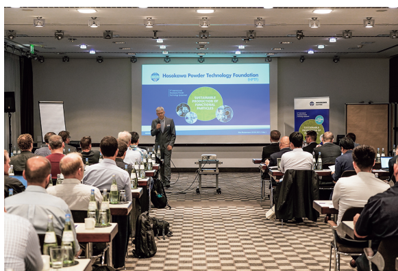
講演会風景 Lecture Scenery