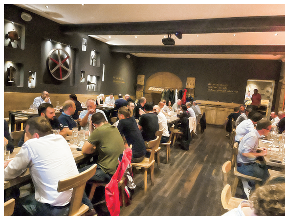
懇親ディナー風景 Get-Together Dinner Scenery