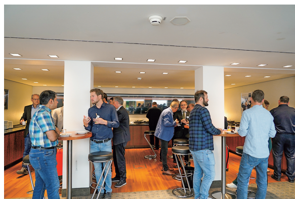
休憩風景 Coffee Break